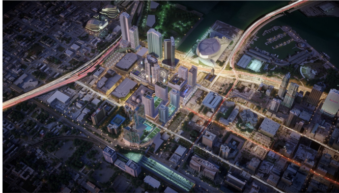
MWC Aerial Night.