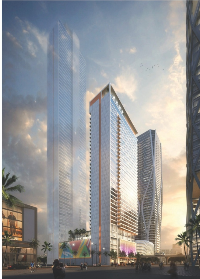
A structure of 79 stories was envisioned for the western side of Miami Worldcenter Block A. Credit: Perkins + Will.