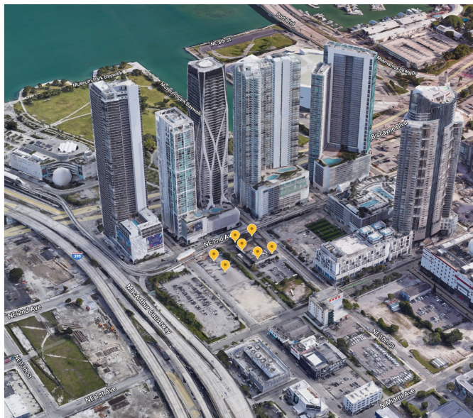
Coordinates for approved permits at the Miami Worldcenter site.

New York-based developer Naftali Group (Naftali) has been granted several building permits for a twin-towered residential project at Miami Worldcenter with up to 1.3 million square feet of potential space. The Federal Aviation Administration and Cara Real Estate Management (FAA) has determined the proposed structures would have no substantial adverse effect on the safe and efficient utilization of the navigable airspace 691 feet above sea level. Naftali formed a joint venture partnership with Quare-foot site at 1016 Northeast 2nd Avenue in Downtown Miami's Park West neighborhood last year for nearly $41 million. Zoning allows for buildings with a maximum floor count of 60 stories.