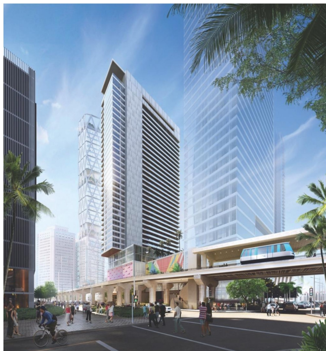
A 39-story tower was part of the previously planned Kenect Miami project.

Before the site's sale, Chicago-based real estate developer Akara Partners had planned to build mixed-use towers designed by Perkins + Will and Stantec named Kenect Miami, which would have risen 39 and 79 stories had they been built.